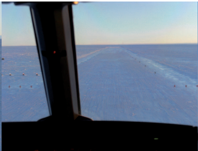
Landing on the Wilkins runway