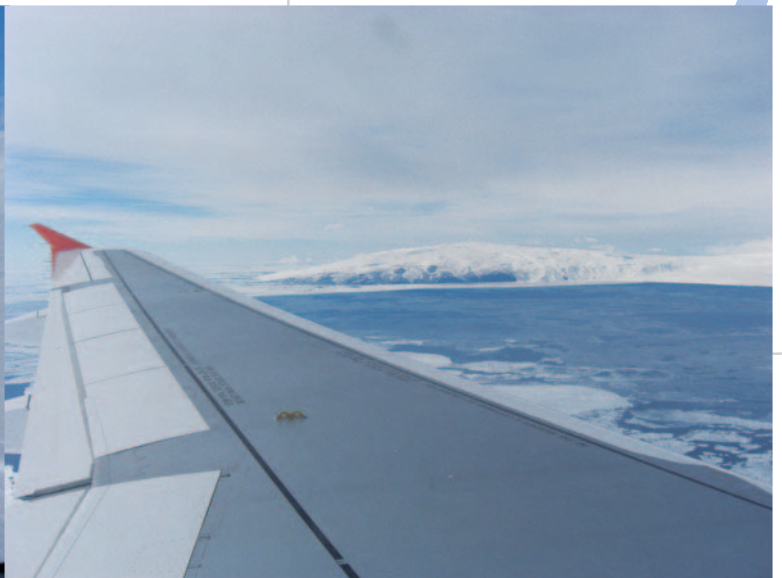
On the way